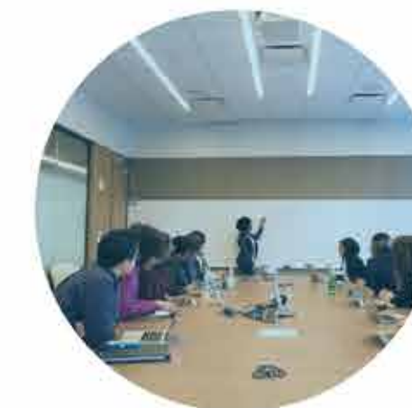
Units, Taskforces & Expert Groups