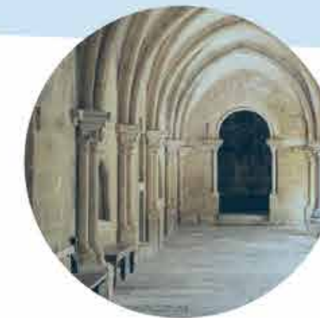
Global Consultative Council