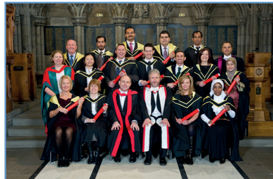
Staff and Students from our first Graduation in 2010 with both Taught and Research students.

By the end of this academic year seven students will have graduated in FRP, fourteen in OMFS, and eight in Orthodontics. Many overseas students have graduated with distinction and merit and are now in senior positions or even running departments in their own countries. We hope they will continue to forge new friendships with us in Glasgow by recommending their younger colleagues to come to Glasgow to study.