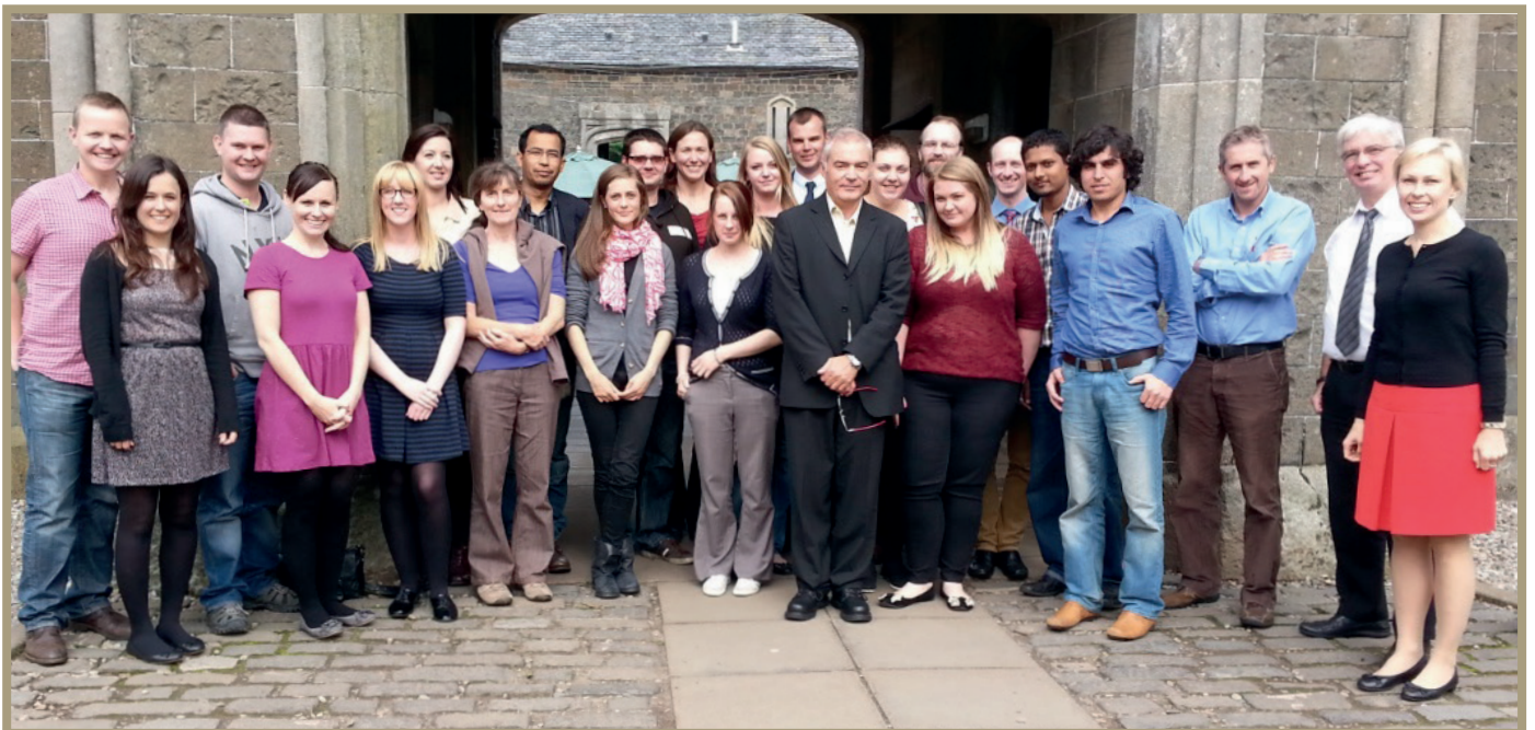
Infection & Immunity annual research away day at Mugdock Park (Aug 2013)

A Smith , Muirhead I, Potts H, Diver D. Scottish Enterprise SMART scheme funding. Prototype development for ozone sterilization units for small medical devices. £TBC.