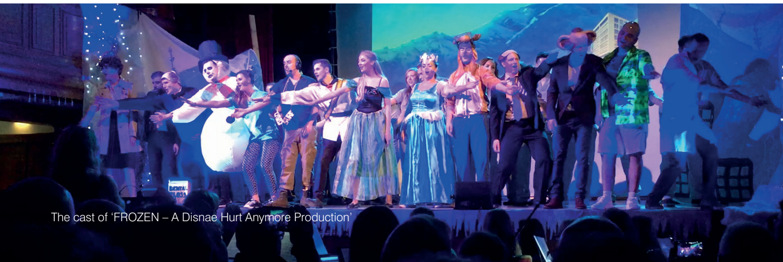
The cast of 'FROZEN – A Disnae Hurt Anymore Production'